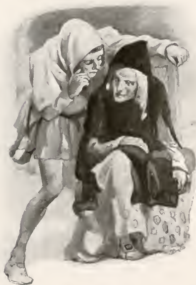
He told her of the plan the brothers had made. (P. 200.)

As the servant rode out of the gateway, Wolf's spy stopped him and enquired whither he rode in such hot haste.